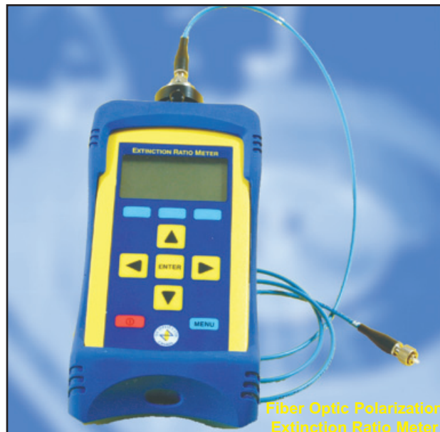
Fiber Optic Polarization Extinction Ratio Meter