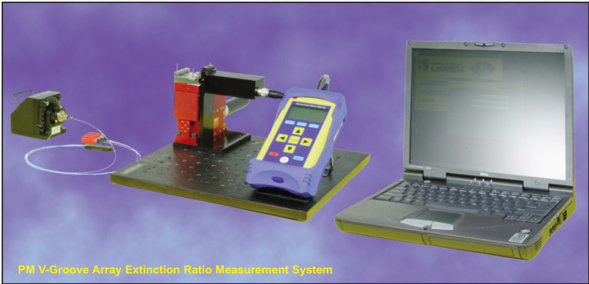
PM V-Groove Array Extinction Ratio Measurement System

The system works by first setting the software configurations for the appropriate V-Groove size and spacing. The V-Groove chip is then attached to the mounting stage and the opposite end of the fiber is attached to the polarized source. After adjusting the stage to roughly align the fiber to the meter, the software is started to take the ER measurement and automatically move the array to the next fiber position. Manual recording of the measured ER and angle is required at this point, optional software is available to log the measurements for later use. At the software prompt, the user must change the fiber on the polarized stable source so the next measurement can be taken.