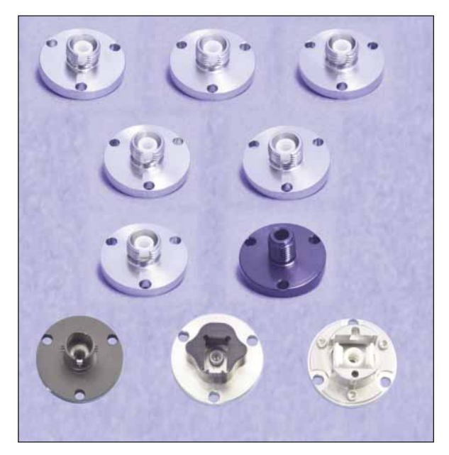
Bulkhead receptacles for ultra, super, or angled connectors with or without stoppers

Sleevethru adapters are use to mate two male connectors together. The flange on the receptacle enables the user to mount the adapter onto a housing or box. Our standard receptacles mate fibers terminated with industry standard FC/PC, FC/APC, SMA, SC, LC, and ST connectors. Universal connectors allow one to mate together fibers with difference connector types, as long as they are polished the same way.