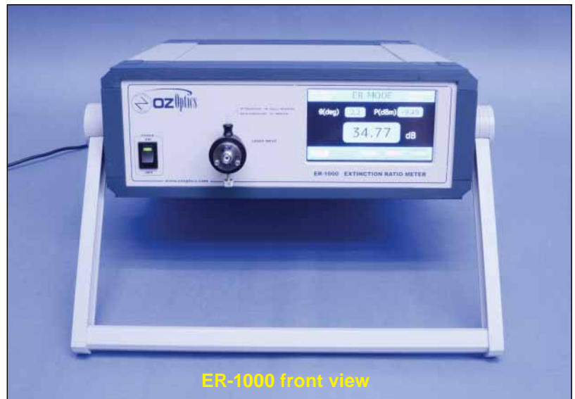
ER-1000 front view

In addition the meter can provide a relative power readout, proportional to the input power in dB. This readout is updated at up to 650 times per second. The computer interface allows the unit to be used with computer control units, for alignment purposes. The combination of polarization and relative power functions allows the unit to be used for complete auto-alignment of polarization maintaining components.