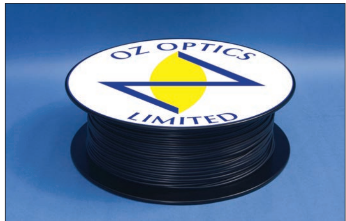
3mm OD Cabled Fiber