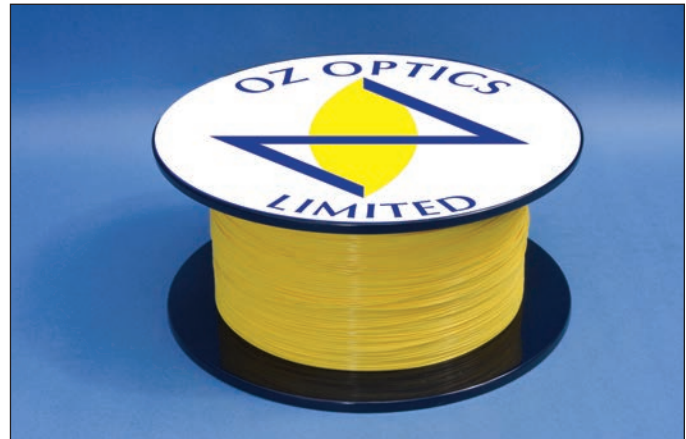
900 micron OD Fiber