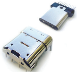
USB 3.1 Type C Receptacles Plug