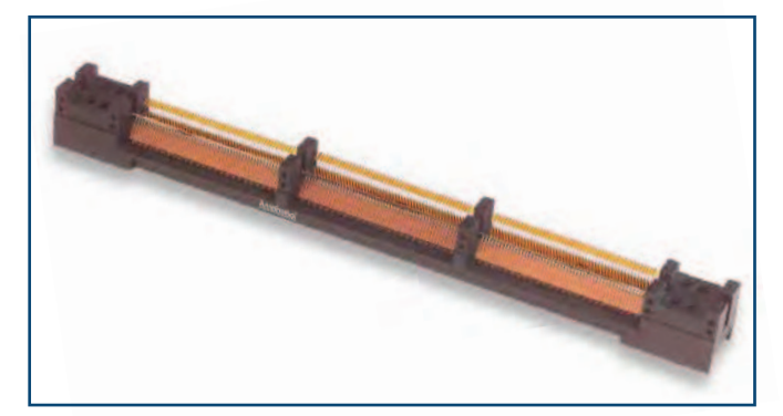
NAFI Daughtercard Connector with Flex Termination