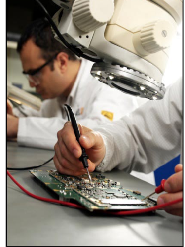
Figure 2: Checking for Design Adherence in prototypes ultimately leads to the workbench.

This dynamic in a production product is well documented with the Motorola Razr cell phone in 2006. Two days before the device was released for sale, some savvy cell phone sales reps noticed that the stock of factory refurbished devices was