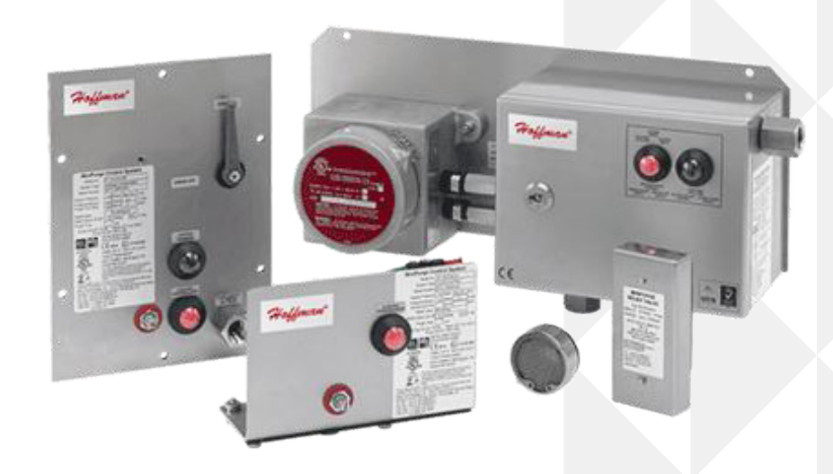
Purge and Pressurization Systems

Energization of the enclosure happens only after the purge and pressurization process eliminates the potential for internal explosive gas inside the enclosure. The completion of this process makes the interior of the enclosure safe for the appropriate devices to be energized. If at any time the pressurization is lost, the enclosure must be de-energized and the purge