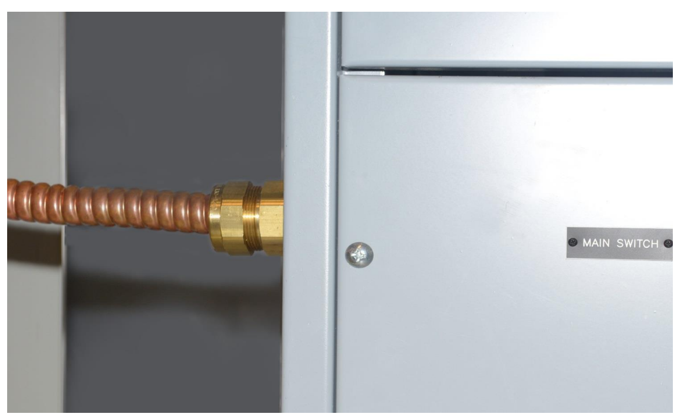
Strip armor from core and terminate to panel with readily available standard brass connector.