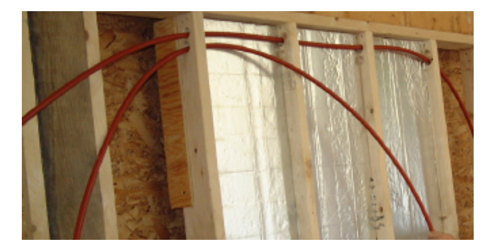
Run the tubing in the spaces within the partition walls.