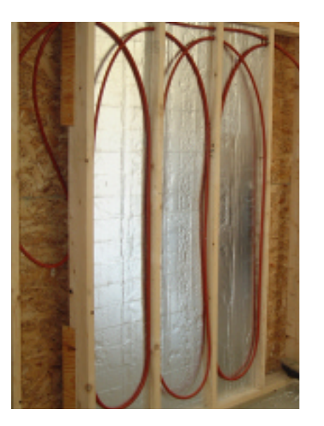
Do not kink the tubing. It is permissible to cross the tubing.