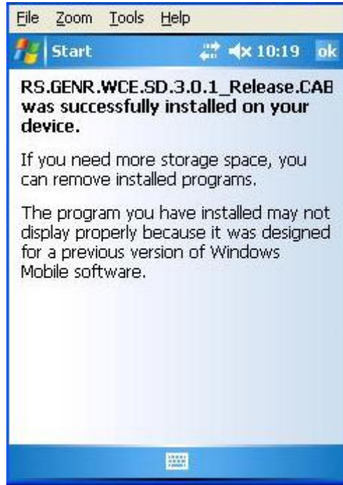
Figure 2: Installation completed

Note: - The above screenshots are based on PDA from Hewlett Packard with WinCE 5.0. These screen shots may vary from device to device, depending on the underlying WinCE version that they are built with.