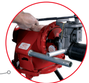
RGCOMBO2 with 5301PDCOMP (sold separately)

Manual Grooving 2-in-1 tool! Power Grooving