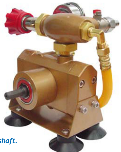
REAR VIEW showing drill shaft.

BEST Service + BEST Quality + BEST People = The LOWEST TOTAL COST