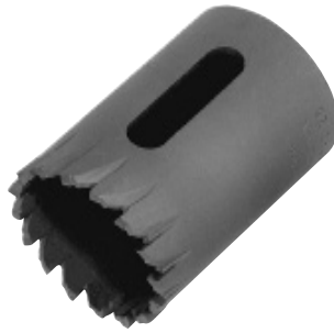
Heavy Duty Carbide-Tipped Hole Cutter