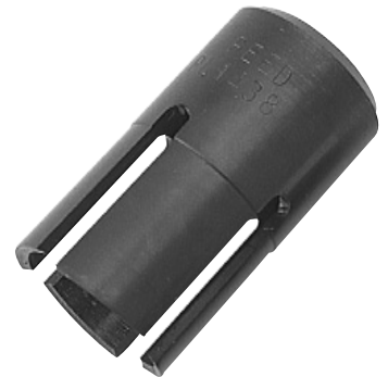
PVC Shell Cutter