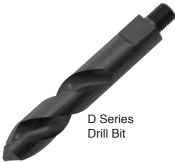
D Series Drill Bit

After purchasing any one of the Drilling Machines, the customer must purchase the appropriate drill bit, hole cutter, or shell cutter.