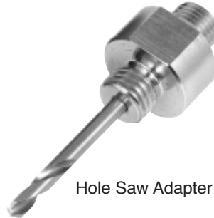
Hole Saw Adapter