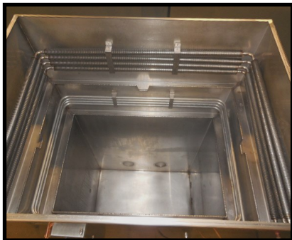
Expanded Vapor Polishing Zone