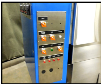
Simple Control Safety Panel