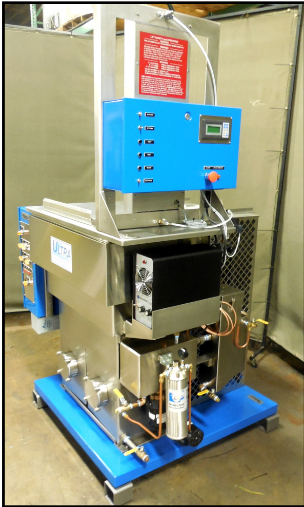
Vertical Basket Handling System for loads up to 35 lbs.