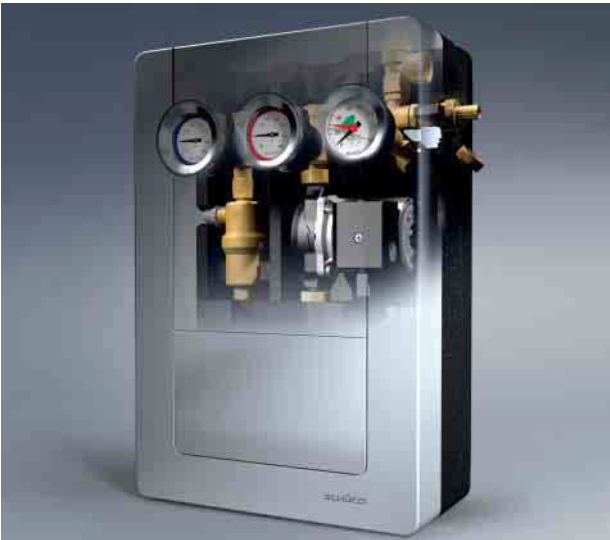
The Solar Station is included with Schüco's integrated thermal packages.

Specifications subject to change without notice.