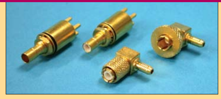
Unique SMB connectors developed for the military to meet specific connection and environmental requirements.

Finally, we had one more issue to solve for them and this solution was not in any physics books. Our customer's concern was that their technicians could accidentally mismatch the input and output