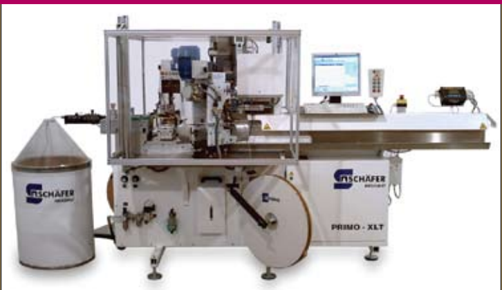
The Schäfer Megomat Primo XLT wire processing machine

IOCONNECT COMMISSIONED an automated wire cutting machine that ensures repeatable accuracy and speed. The Primo XLT was designed specifically for Bioconnect in Wisconsin by Schäfer-MEGOMAT for the purpose of cutting, trimming, and attaching sockets or pins to small diameter wire. The Wirestar software controls the entire operation once setup is completed. It will monitor wire length and cutting specifications while in operation and halt if an anomaly occurs. The slide collector tray holds the finished product until the run is completed. The precision of the machine allows parts to bypass three operations and head straight to the molding operation saving time and money. Capacity, depending on length, is around 3600 parts per hour opposed to 900 per hour using the old method. The capabilities and volume capacity of this machine yield cost savings, enabling us to keep our prices competitive. Bioconnect