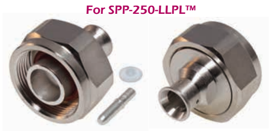
4.1-9.5 (Mini) DIN Male RFD-4195-HPL

*NOTE: Due to the precise nature of the soldering of the inner and outer conductors to achieve low PIM specifications, RF Industries cannot guarantee PIM performance on the finished assemblies when connectors are field installed. If you need guaranteed PIM performance, we strongly recommend factory installed assemblies made to your specifications.