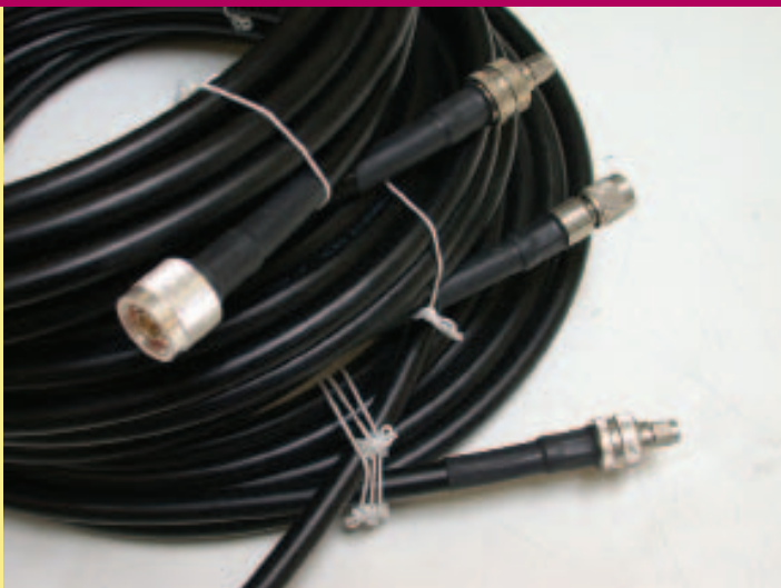
Cable Assemblies for LMR®-400

T ODAY'S WIRELESS COMMUNICATION SYSTEMS REQUIRE HIGH PERFORMANCE RF CABLE ASSEMBLIES built to custom lengths using a variety of connectors. RF Cable Assembly, a division of RF Industries, fabricates custom assemblies with Times Microwave LMR®-400 high performance low loss cable. Assemblies are available in lead-free RoHS compliance upon request. Custom lengths from 4 inches to over 400 feet are available. Connector terminations include Male or Female N-type, 7/16 DIN, TNC, BNC, and SMA. Connector materials are generally silver or tri-metal plated machined brass bodies, PTFE dielectrics, and silver or gold plated contacts.