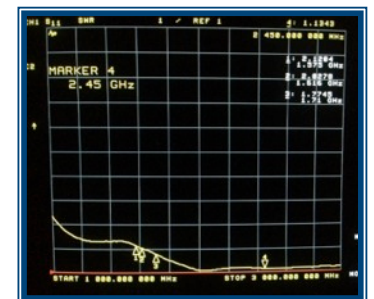
Fig 3.0 RF Coupler VSWR Rev 1.0 |11/12/2014