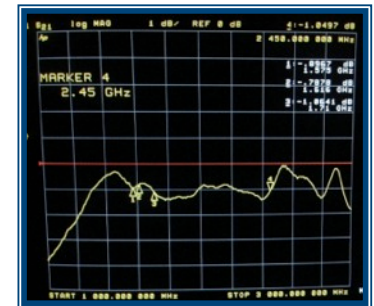
Fig 2.0 RF Coupler Insertion Loss S21 (dB) *