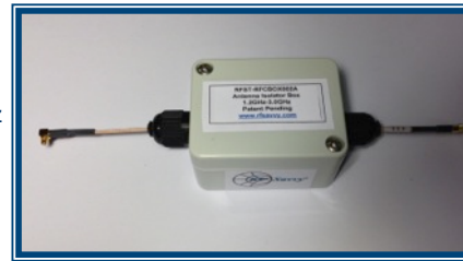
Fig 1.0 Microwave Frequency Antenna Isolator Box (NEMA 4.X Enclosure/Cable glands) (MMCX term. for illustration only)