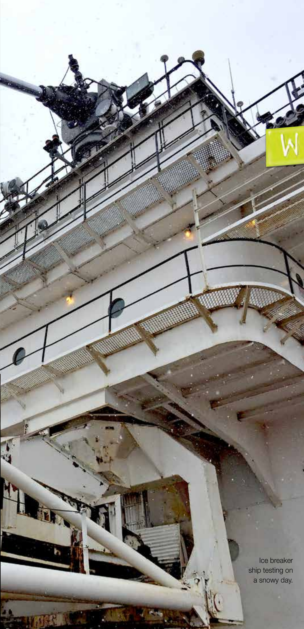
Ice breaker ship testing on a snowy day.