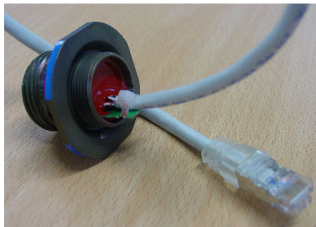
RJF TV 7SA2 G 05 100BTX