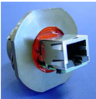
RJF 7SA1 G