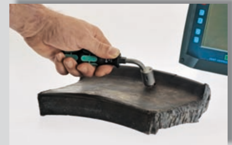
Test set for rough environmental conditions with LED-crack indicator on the probe