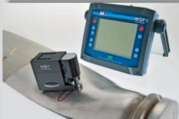
Dynamic surface crack detection rotor blade