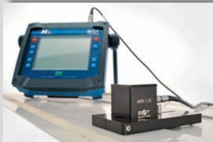
Crack detection of hidden defects in aluminium rivet layers