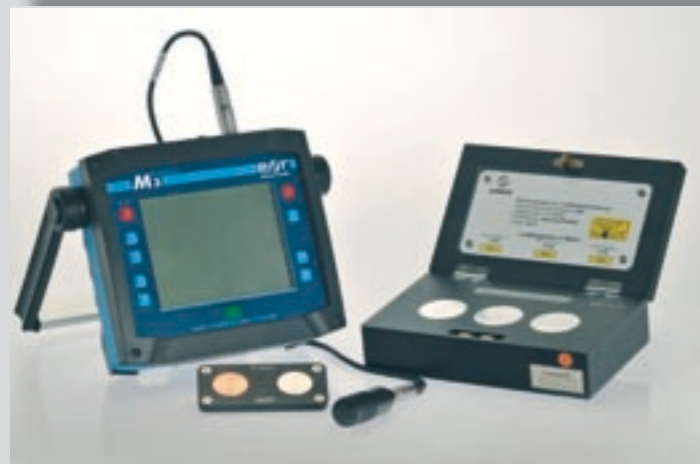
Conductivity measurement in IACS or MS/m from 1 % up to 110% IACS