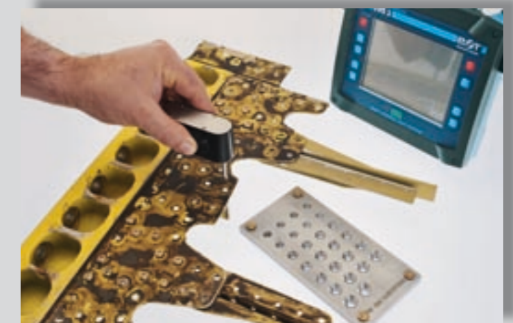
Bore hole inspection with mini rotor on aluminium structures