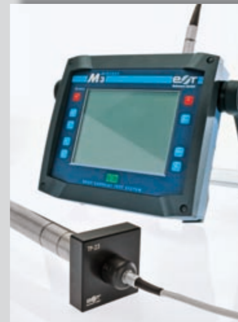
Dual frequency inner tube inspection with signal-mix function