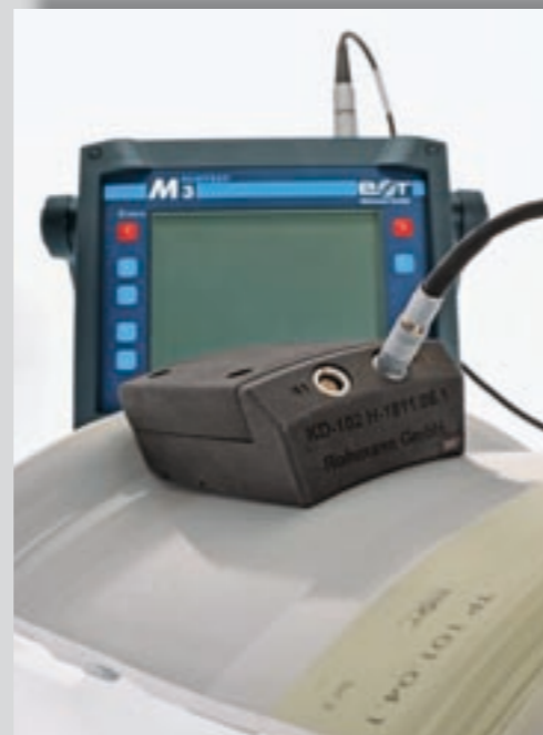
Manual surface crack detection with adapted contour sensor