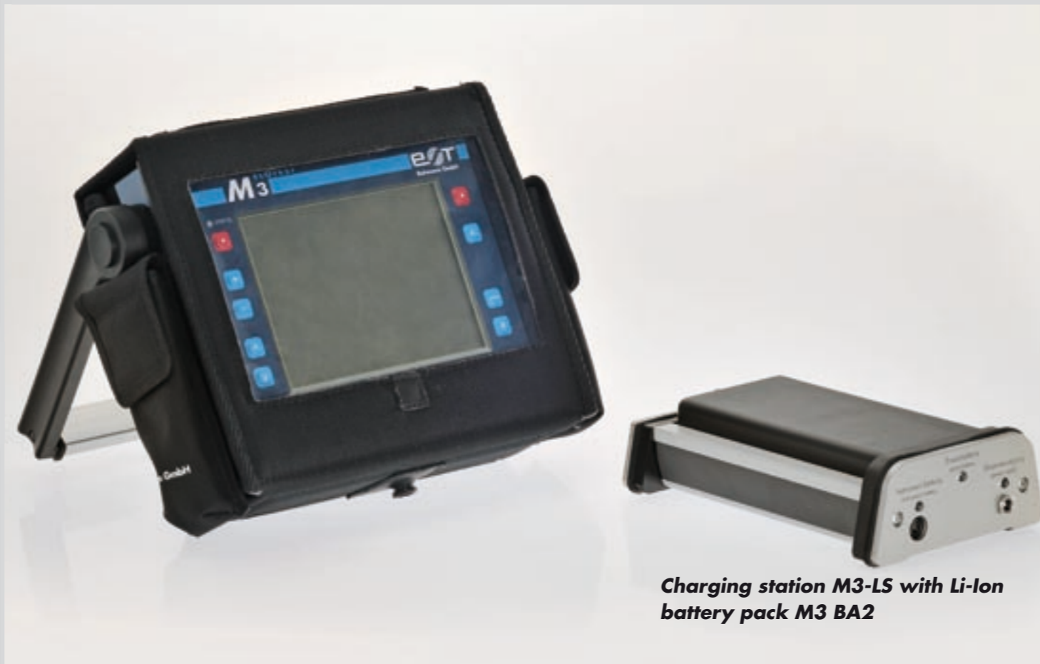
Dual frequency eddy current instrument ELOTES M3