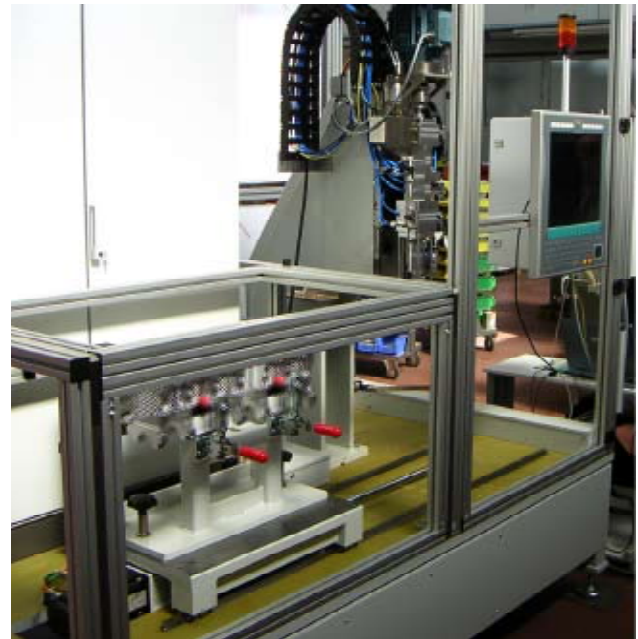
Flexible inspection system