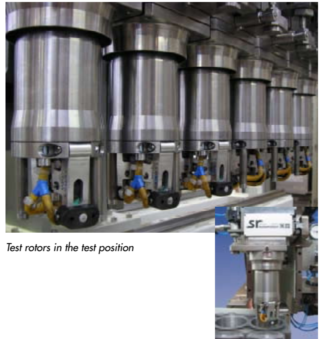
Test rotors in the test position

Cycle time: 3 cylinder crankcases per minute