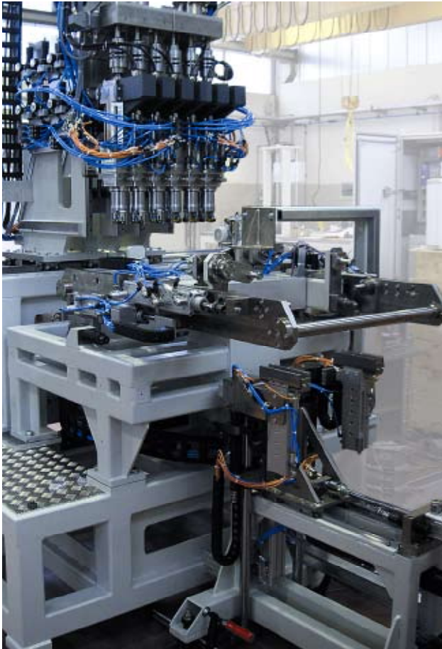
Serial inspection system