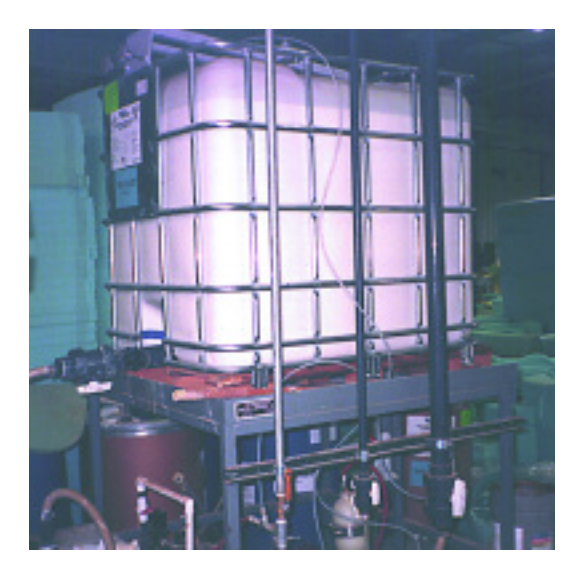
Engineered tote system for foam fabrication

What sets Royal Adhesives & Sealants apart from the rest is the fact that we provide you with a complete system. Besides the actual adhesive we can engineer a process that includes a delivery system (permanent or mobile installation) to get it from the package to your parts. One phone call for everything.