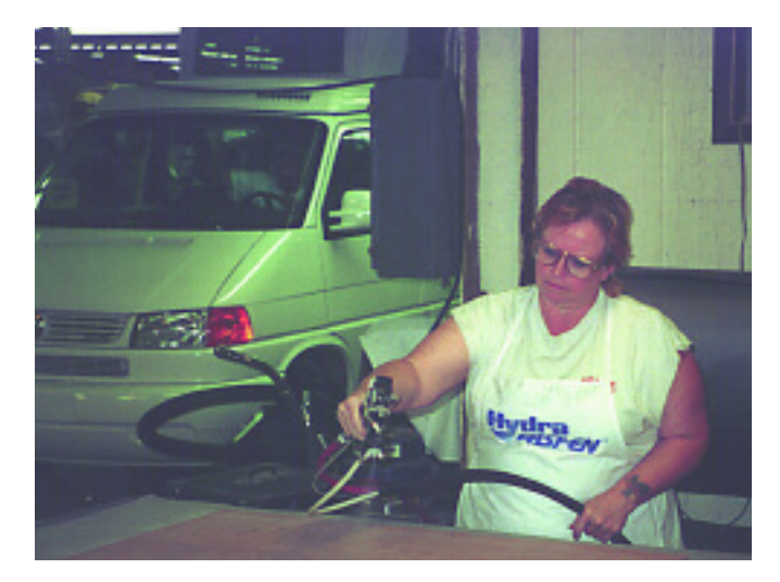
Major RV OEM Using a Portable HYDRA 55 to Spray M6187 to bond wood to foam for headliners and (below) foam and fabric to a metal seat boxspring