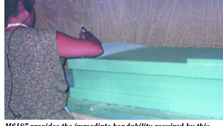
M6187 provides the immediate bondability required by this manufacturer of an RV sofa.