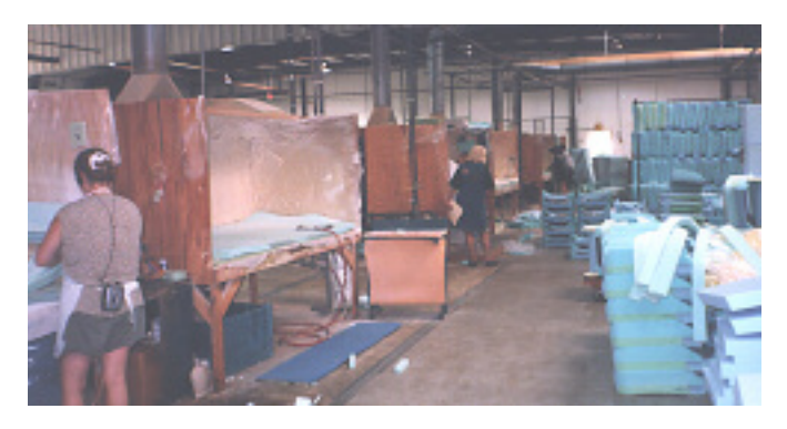
Fabrication stations with gun drop panels off of master tote system