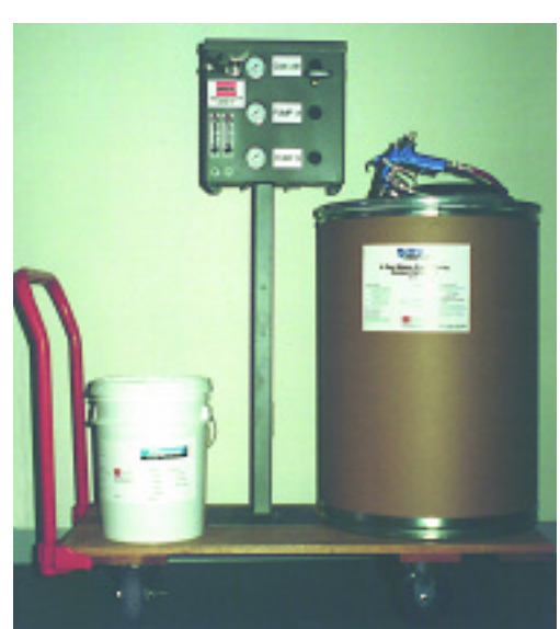
1or 2 gun portable HYDRA 55 on mobile cart