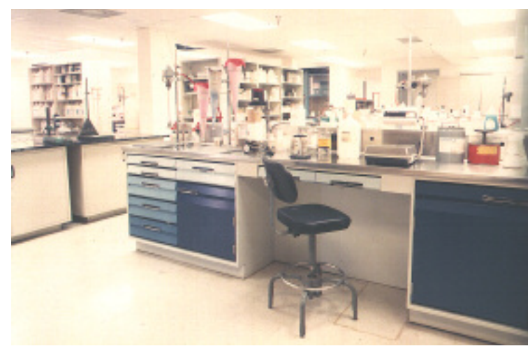
Research and Development Labs