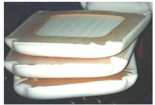
In an extremely demanding application for a water-based adhesive, M6187 is used to bond 3 pieces of different density foams to the edge of a wood seat frame.