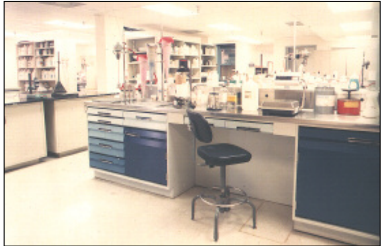
Research and Development Labs

Contact Adhesives are available in both solvent and water-based formulations. Silaprene solvent based contact adhesives provide strong tack and quick strength buildup with flexible bonds that resist heat, cold and water. They can be used to bond rubber and vinyl flooring as well as general purpose applications. Our Hydra FAST-EN brand water based sprayable contact adhesives are designed to bond a wide variety of porous and nonporous surfaces where using solvent based systems may be a health or environmental concern. They can be used to adhere headliners or carpeting, and for HPL laminating for cabinet work.