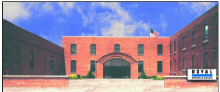
Home of Royal Adhesives & Sealants

For over fifty years, Royal Adhesives & Sealants has been a leader in adhesive technology, providing superior quality and performance for the most difficult bonding applications. Our fully staffed state-of-the-art laboratory can develop custom formulations to meet any need. Testing services are also provided based upon individual requirements.