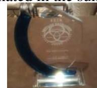
Northrup Grumman Excellence Award

And last fall, we won the annual Northrup Grumman Supplier Excellence award for which we had been nominated in the summer.