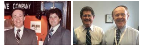
Then & Now Still smiling after all these years!!

pride. To this day, we are blessed with employees with the same enthusiasm, pride and loyalty. Any future success we might have will be a function of being able to encourage such characteristics and recognize employees for their continuing contributions. I am very proud to have reached this 35 year milestone, and look forward to the next 5 years and reaching our 40th! Keep it up folks, I am proud of all of you!