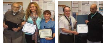
10 & 15 Year Honorees