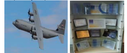
Our Filters Soar and Rewards Abound!

Following the recognition by Lockheed Martin in March 2015 for our 100% quality and delivery in 2014, we have continued to be recognized for outstanding performance by other customers! Late last summer, Boeing rewarded our performance excellence with a trophy proudly displayed in our awards case.