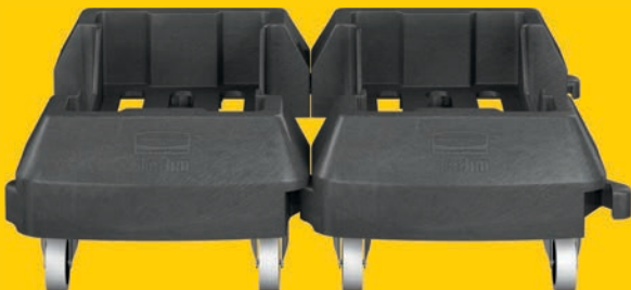
Resin Trainable Dolly