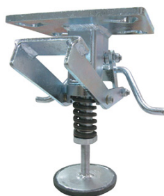
Adjustable Floor Lock

The RWM Adjustable Floor Lock eliminates the need to buy multiple locks for different carts. This lock can be applied to carts with wheels 6" to 8" in diameter. In addition to a foot-activated locking and unlocking mechanism, a rubber-bottom pad secures floor grip to lock the cart in place. This bottom pad rotates to allow the height of the floor lock to adjust up to 2-3/4". A zinc-plated coating protects from corrosion. By design, the adjustable floor lock is ideal for use on carts with different caster heights and stabilizes carts for loading and unloading by locking the cart while holding all wheels in position. For full specifications, see model FL-6-8-ADJ below.