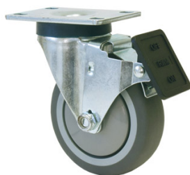
27 Series with ICWB Brake