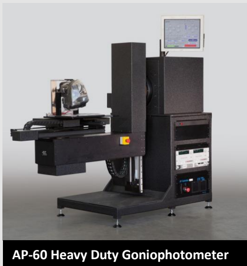
AP-60 Heavy Duty Goniophotometer