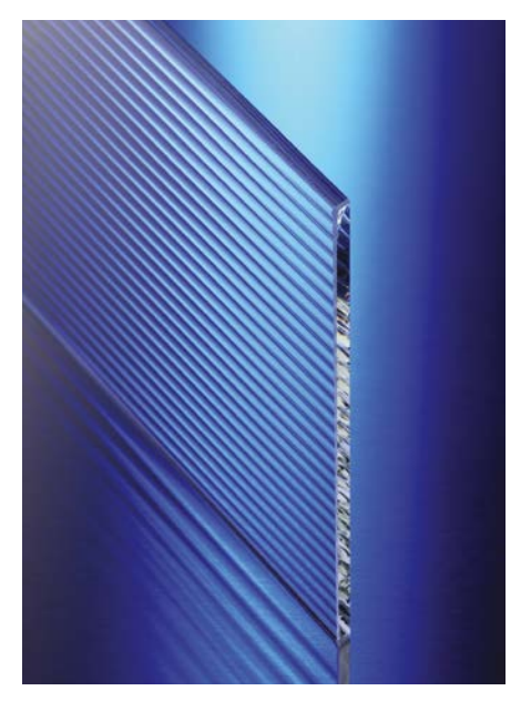
The fine structured decorative glass SCHOTT RIVULETTA® opens up new design possibilities.

Straight and purist in form, elegant in its look and feel: thin, parallel flutes running along one side give RIVULETTA® its timeless, classical beauty. A design which is wholly created from the material itself. In contrast to it, the flat back side that underscores the brilliance of its overall impression with its likewise fire-polished surface.