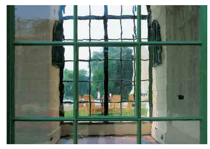
Orangery in Schwerin Castle

Restoring historical monuments is a delicate task in which every aesthetic nuance is important. SCHOTT's restoration glass provides the broad range of materials that architects need to achieve this. The traditional Fourcault process is applied in production, and the look is based on window glass used in different historical periods.