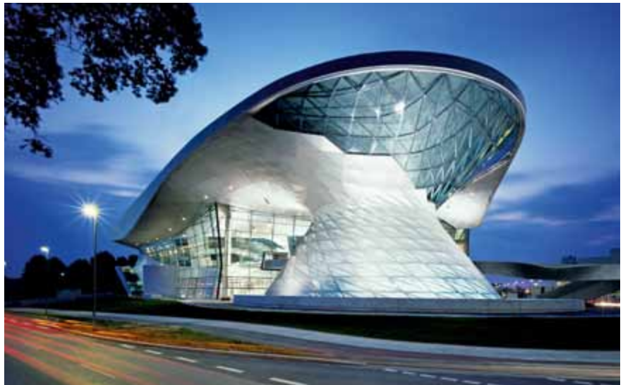
Left: BMW Welt, München

colors and patterns. Insulating glass constructions offer even more new possibilities – and not just in the area of design. The spectrum ranges from improved energy efficiency and thermal insulation to protection from sound and the sun, and even protection from x-ray radiation. Precisely tailored special construction even allows for glazing that has bullet resistant properties, is capable of setting off alarms and resisting burglary attempts by preventing penetration – simply ideal for banks, jewelry stores, prisons, embassies and other high-security buildings.