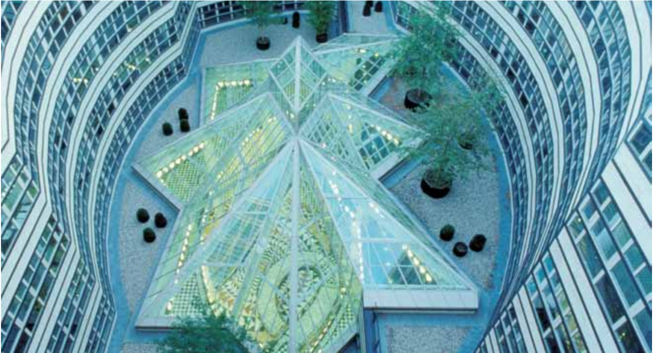
The roof of this house on Friedrichstrasse in Berlin consists of ISO PYRAN® S special glass for use in fire resistant glazing.