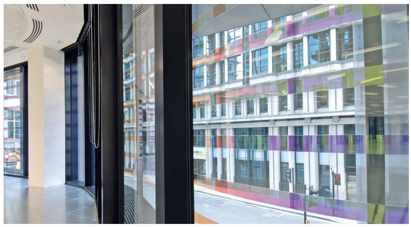
Fascinating view: NARIMA® used in the "60 Threadneedle Street" office building in London Architect: Eric Parry Architects