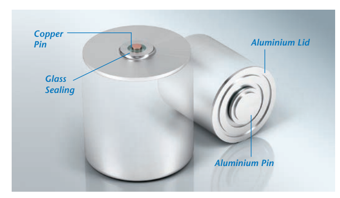
Lid systems for cylindrical battery cells with glass-to-aluminium sealed terminals

Based on extensive experience with primary battery packaging and hermetic sealing technology, SCHOTT now offers the complete battery and capacitor lid system for both prismatic and cylindrical shape battery cells with glass-to-aluminium sealed terminals. The lid systems can be welded directly onto the cell case.