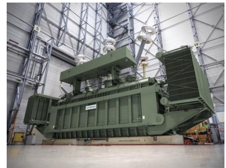
Variable shunt reactor in the test bay.

Up to now, two units have been successfully manufactured and tested. The first unit was commissioned in 2016. More units are in Siemens' order backlog for 2018 and 2019.