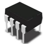
Fig. 3: DIP-8 Package.