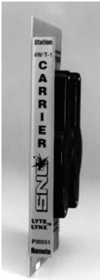
Figure 1: Photo of P30051 4-Wire DSI Isolation Card