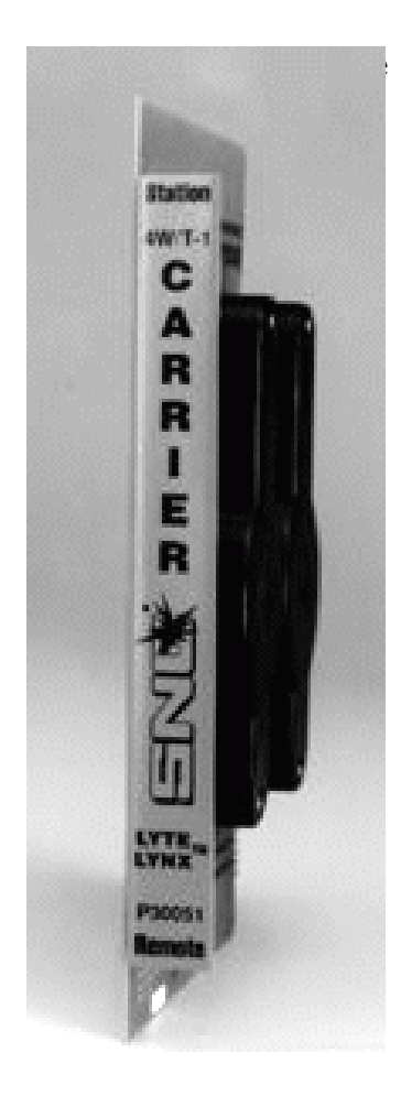
Figure 1: Photo of P30051 4-Wire DSI Isolation Card