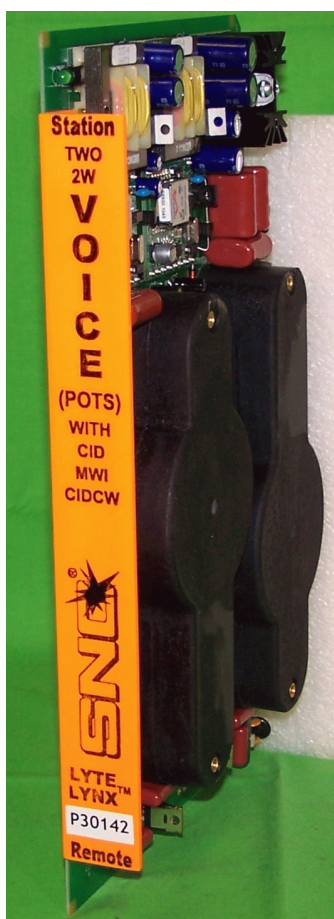
Figure 1: P30142