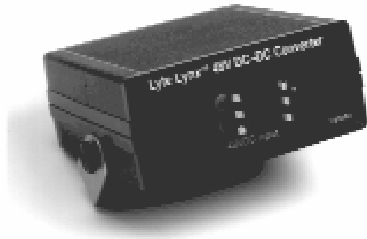
Figure 1: Power Supply with Mounting Bracket