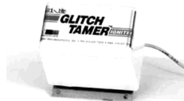
Glitch Tamer Igniter - P31069 UL Listing 100902

The excitation units are bridged to the tip and ring conductors of a working pair in the cable which serves the equipment to be protected. A ground must also be connected to the TEN, HDR, Igniter or Super-TEN. For additional information on the use of TENs, Super-TENs and HDRs, refer to the application notes for those products.