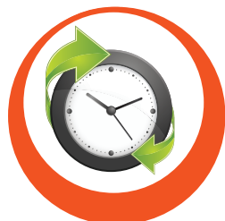
24x7x365 Technical Support

Rely on a single source to simplify site maintenance—saving you time, money, and effort. AE Solar Energy service covers everything from your inverters to PV modules, electrical systems, tracking systems, and periodic reporting.