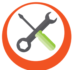
Inverter Preventive Maintenance

24x7x365 phone support Live phone support with expert technicians Prompt service Ample parts inventory