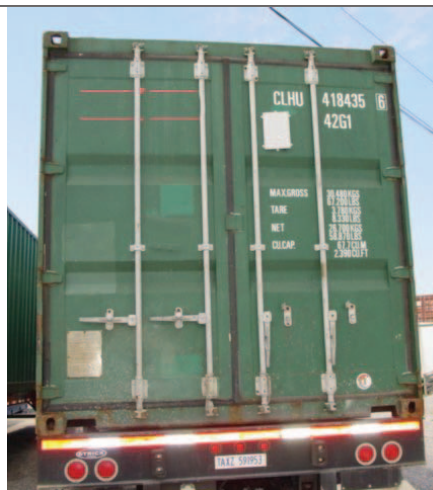
THE TRACKING UNITS (white square) attach to the outside of cargo containers, railcars, or trailers.

To make the tracking unit a true stand-alone and self-contained device, Axonn selected a hybrid lithium thionyl chloride battery for integration into the unit. Of all of