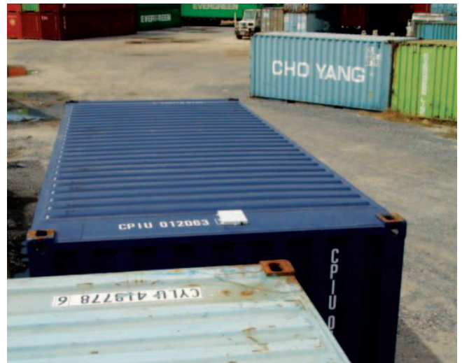
THE AXTRACKER (white square) on a container in a transit yard. 250 million unpowered cargo containers and other platforms travel the United States carrying raw and finished goods.

The mobile tracking device incorporates new simplex satellite communications technology that enables transmission of packet-switched data. The unit leverages Axonn's core RF spread spectrum data communications technology created by Axonn for the automated meter reading (AMR) market and other applications. The simplex modem utilizes the same custom ASIC developed by Axonn to digitally spread the satellite signal. This is the same basic technology installed over the past 10 years in more than