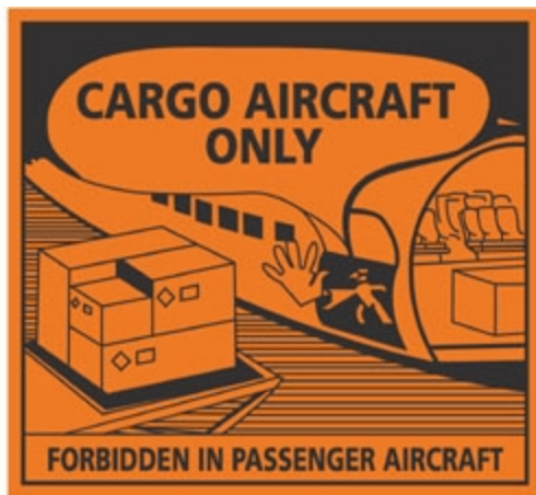
Handling Label Cargo Aircraft Only, reduced size, black on orange