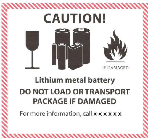
Lithium Battery Label (IATA 7.4.H)

reduced size. black on white, red boarder with diagonal hatchings