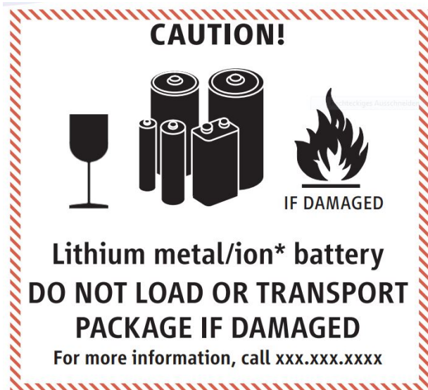
Lithium Battery Handling label, reduced size, black on white, red boarder with diagonal hatchings