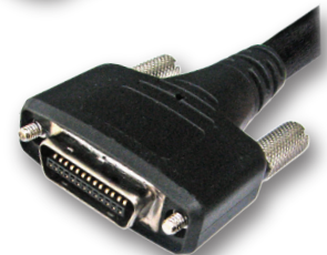
Camera Link MDR Connector