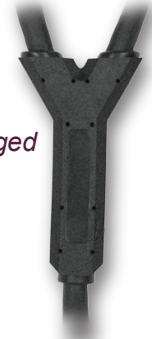
“Y” Mold for 3-Legged Cables