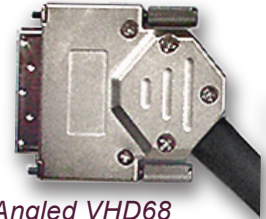
45° Angled VHD68