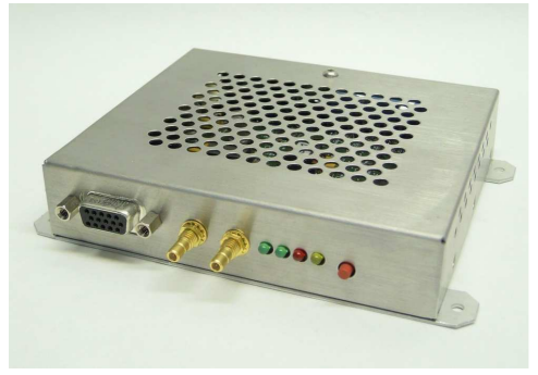
Module MLC-03A-MP1 for OEM lasers using 12V DC