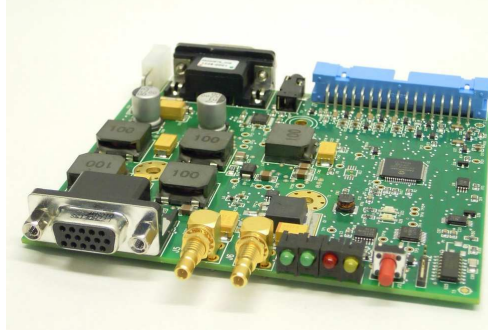
Board MLC-03A-BP1 for OEM lasers using 12V DC