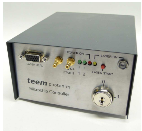
Desktop MLC-03A-DP1 for CDRH certified lasers and 100-240V AC