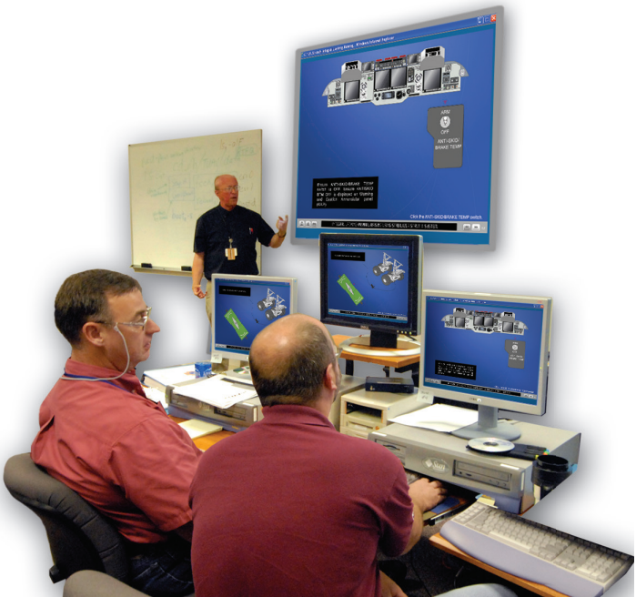
Training specialists develop and execute comprehensive aircrew and maintenance training system strategies for successful training outcomes.

In addition, we provide UAS classroom and hands-on training, courseware development, and training devices and sustainment for UAS operators and maintainers to hone individual and collective skills before, during and after deployment.