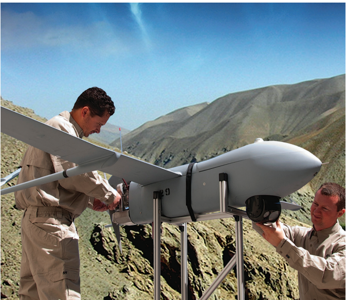
Our skilled operators and maintainers ensure system readiness and deliver high-quality situational awareness.

In addition, we offer training system sustainment to ensure high system availability for trainees. Modifications and upgrades are managed to ensure concurrency between training devices and platforms, as well as extend device life and capability.