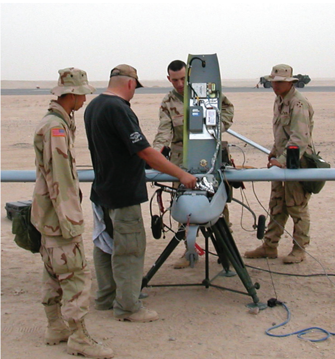
We offer hands-on training for UAS operators and maintainers to hone individual and collective skills before, during and after deployment.