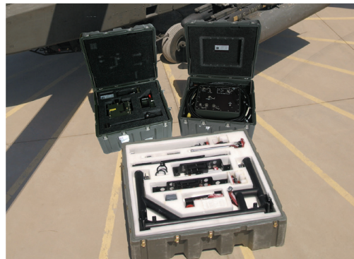
The ABE field boresight system for Apache helicopters is contained in three compact, rugged, easily transportable transit cases.