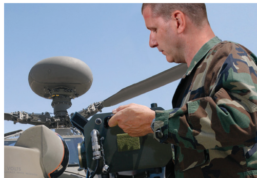
ABE projects accurately aligned infrared or visible images into optical sensors, eliminating the need for station-unique adapters for most optical systems.