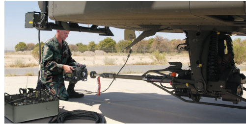
ABE easily aligns the Apache® area weapon system using a small adapter. The need for an unobstructed line-of-sight between the aircraft reference and the stations is eliminated.