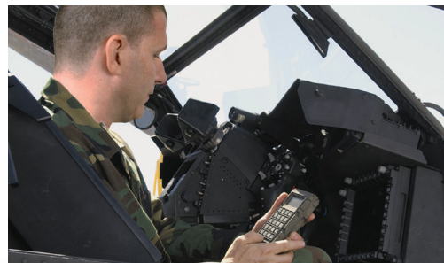
The portable HHDU allows an operator to view boresight results at any location. ABE is designed to align systems on any land, sea or air vehicle.

The ABE Model 310A is a truly common, multi-platform boresight system and is in inventory throughout the U.S. Army, Navy, Air Force and Marine Corps, allied military and aircraft manufacturers. The system works in all operating environments including concurrent aircraft maintenance and assembly, high winds, cramped and cluttered workspaces, and in extreme temperatures. Our system provides an accurate, repeatable and verifiable solution.